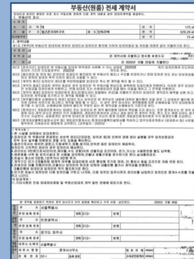
『 Proof of Residence 』

Certificate issued after your arrival in Korea