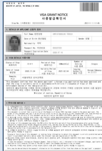
『 Visa 』

Clear copy of the personal information page