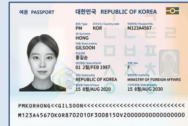
『 Passport copy 』

Front view, full face photo with white background, taken within last 6 months